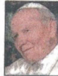
Pope John Paul II

John Paul's statement is not likely to shake many in his church, which has long assumed the cred-