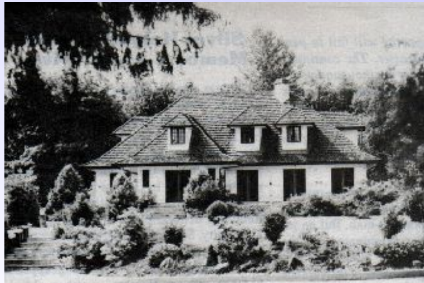
Radiant Living Evangelistic Centre for Metropolitan Vancouver.

Here's the Bible worker outpost center they were renting.