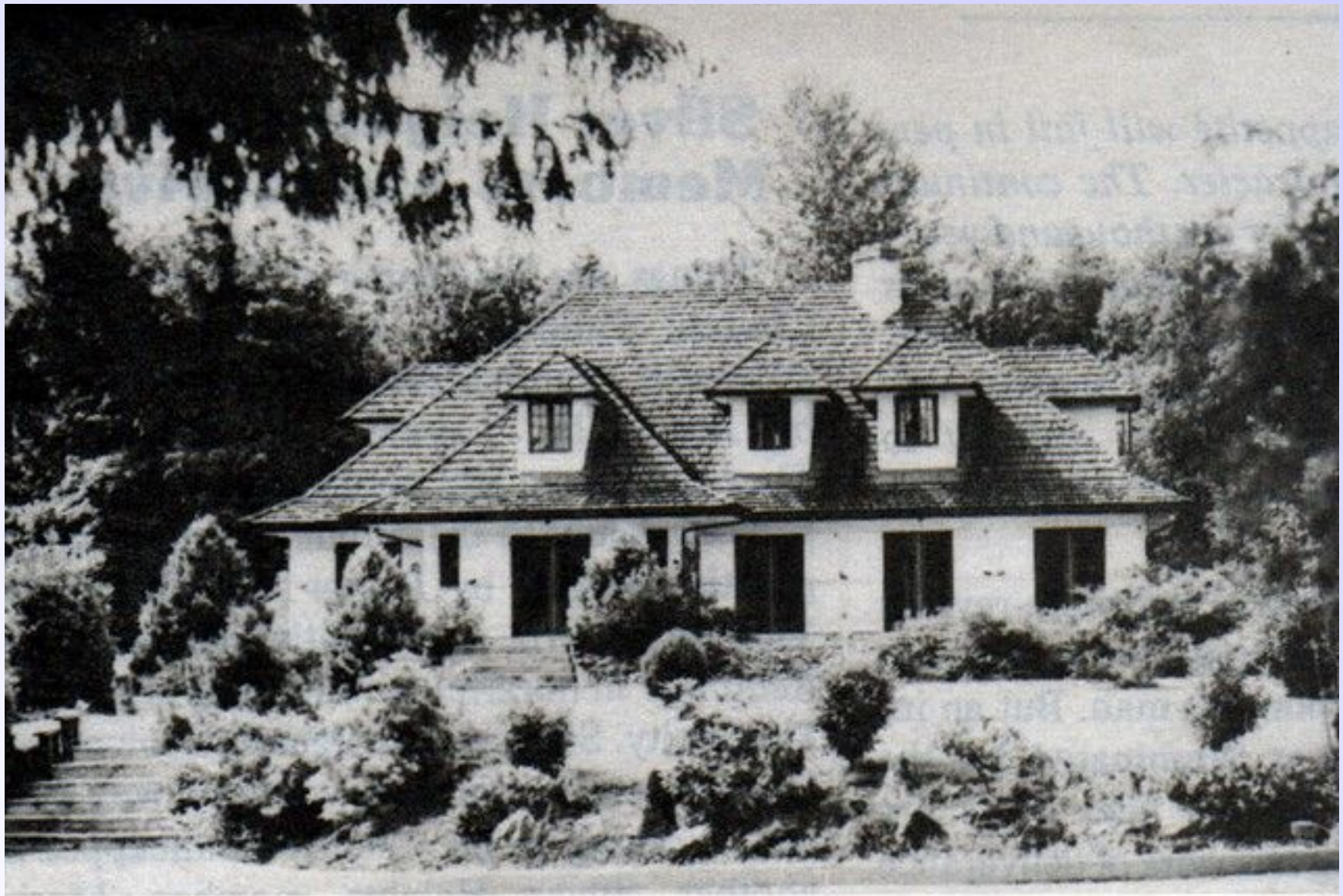
Radiant Living Evangelistic Centre for Metropolitan Vancouver.