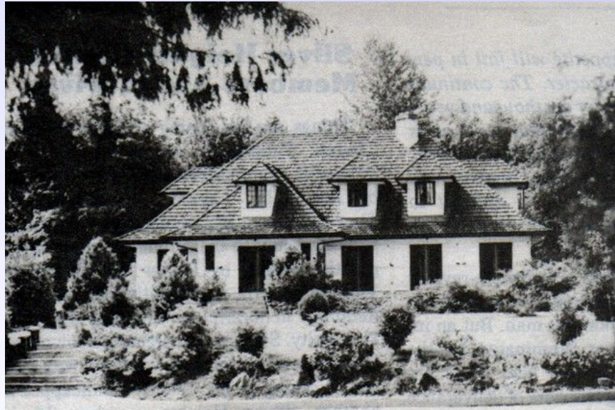
Radiant Living Evangelistic Centre for Metropolitan Vancouver.

Here's the Bible worker outpost center they were renting.