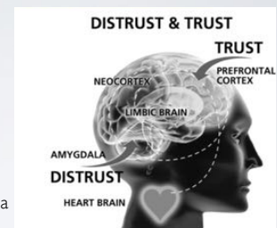
FIGURE 2-1: Distrust and Trust

Conversational Intelligence: How Great Leaders Build Trust