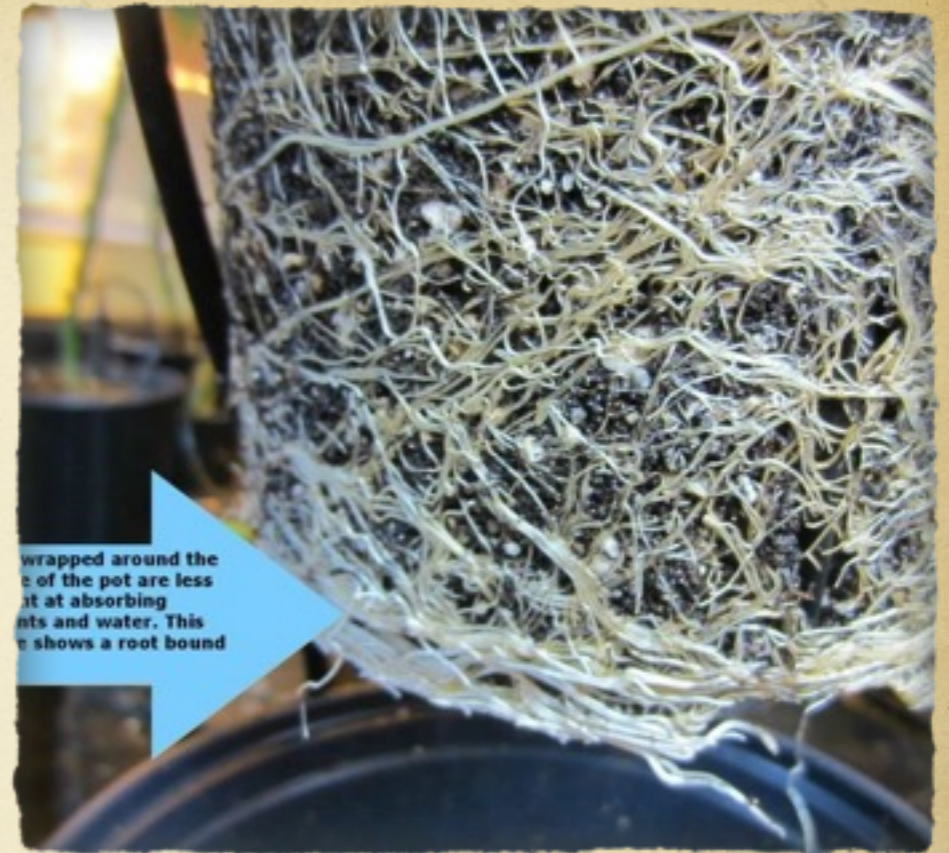
Roots wrapped around the inner walls of the pot are less effective at absorbing nutrients and water. This image shows a root bound plant.

https://atlantishydroponics.wordpress.com/2013/04/25/spring-raised-bed-vegetable-gardening-a-guide-to-organic-soil-amendments-organic-fertilizers/