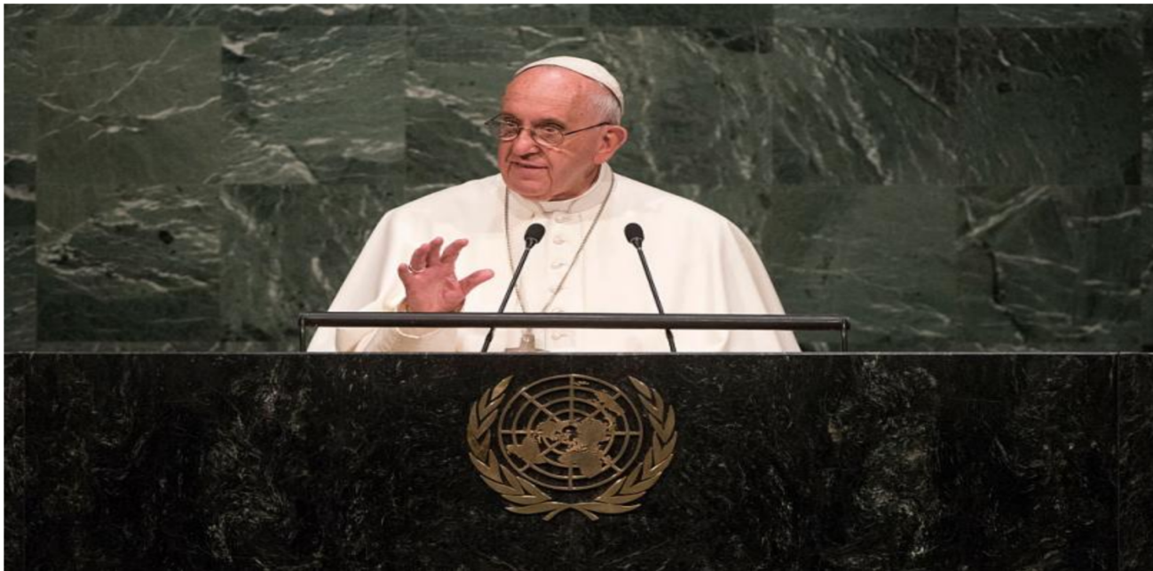
Pope Francis addresses the General Assembly during his visit to the United Nations headquarters in New York, U.S., Sept. 25, 2015.