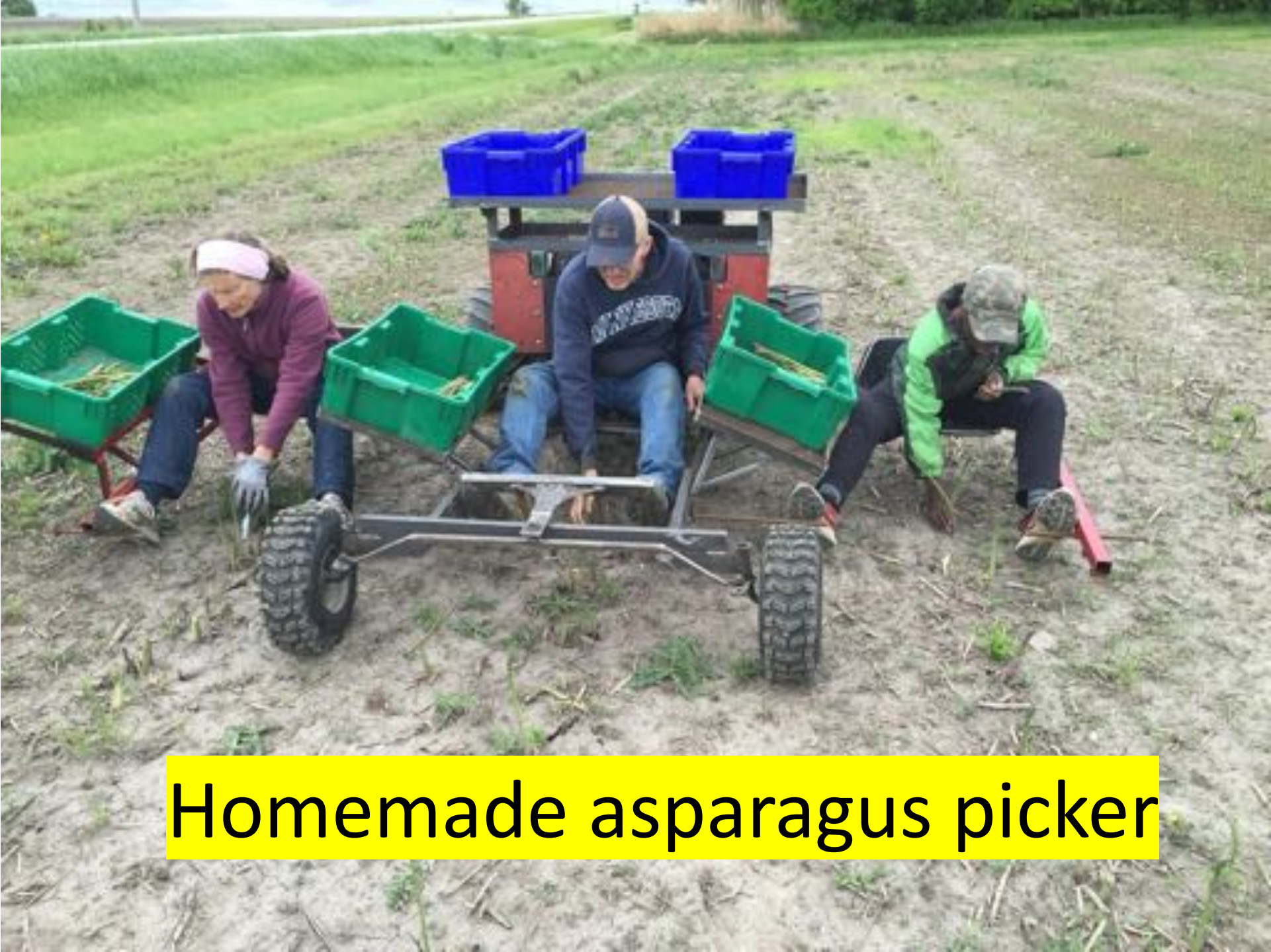
Homemade asparagus picker