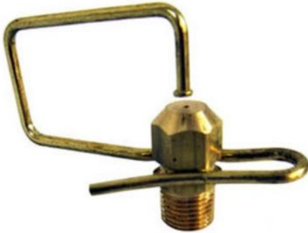
Dramm 60-12344 12344 1 GPM Fog-It Nozzle Fine Heavy Duty Brass