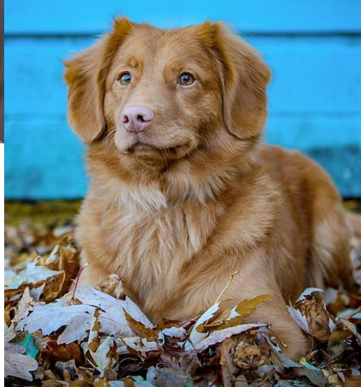
Nova Scotia Duck Toller