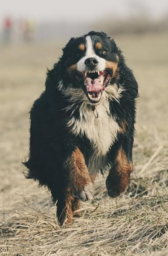
Bernese Mountain Dog Working Group